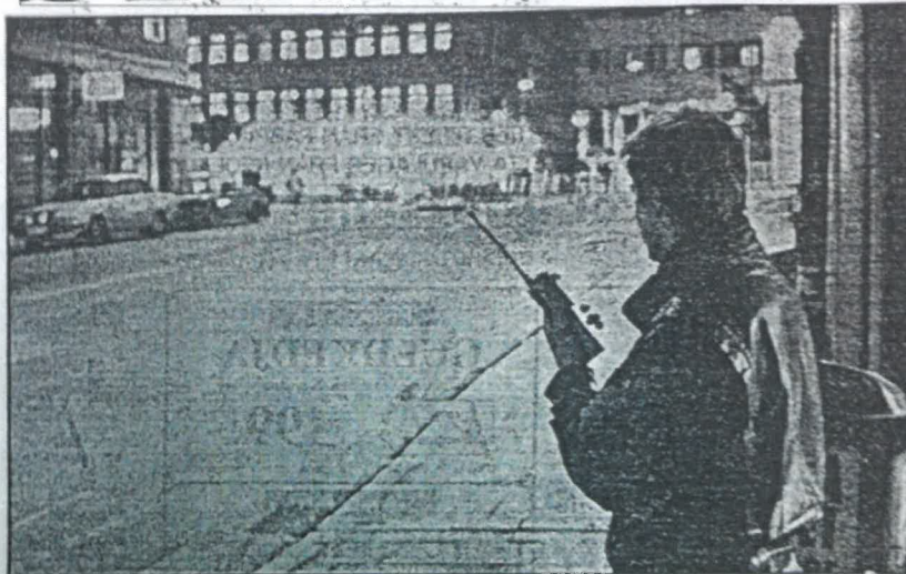
De mystiska män, som enligt många vittnen, sågs i närheten av Olof Palmes under mordnatten, ska enligt de nya uppgifterna ha varit medhjälpare åt en manstark mördargrupp från ett sydafrikanskt poliskommando.

Enligt informanten planerades mordet av tre män: den tidigare sydafrikanska ledaren Craig Williamson, en europe som nu-